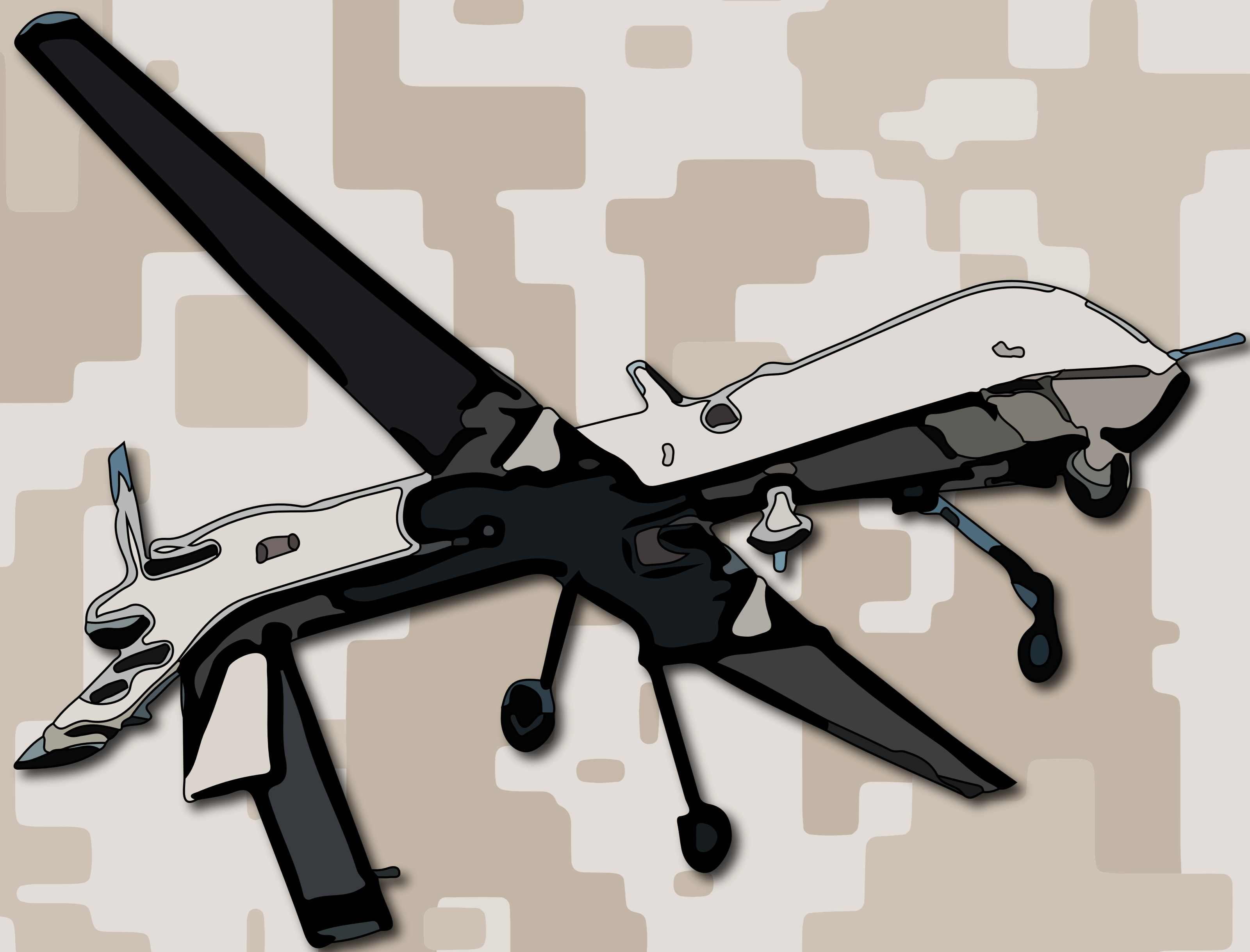
Unmanned Aerial Vehicle